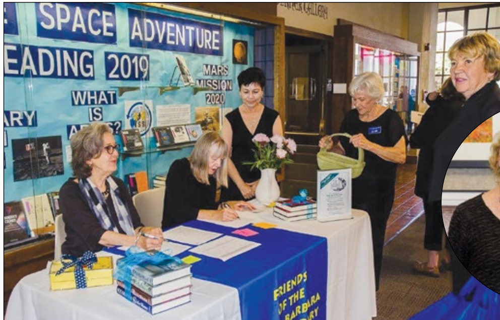
FOL Board ... hard at work and having fun!!!