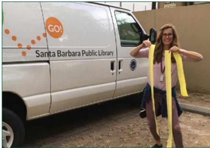
The library opened its support to Montecito schools and residents during the disaster in December and January!