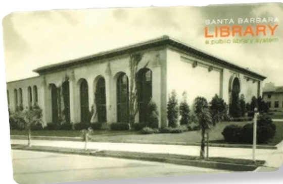
In honor of the centennial, library patrons can trade in their regular library card for this beautiful historical card showing the library in 1917.